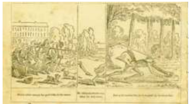
Fig. A page from Historie de M. Vieux Bois

Comic strips became the area of interest for the Swiss author and caricature artist, Rodolphe Topffer, who is usually considered as the father of the modern comic. One of his first works, ' Histoire de M. Vieux Bois ' (1827), eventually inspired subsequent generations of comic artists.